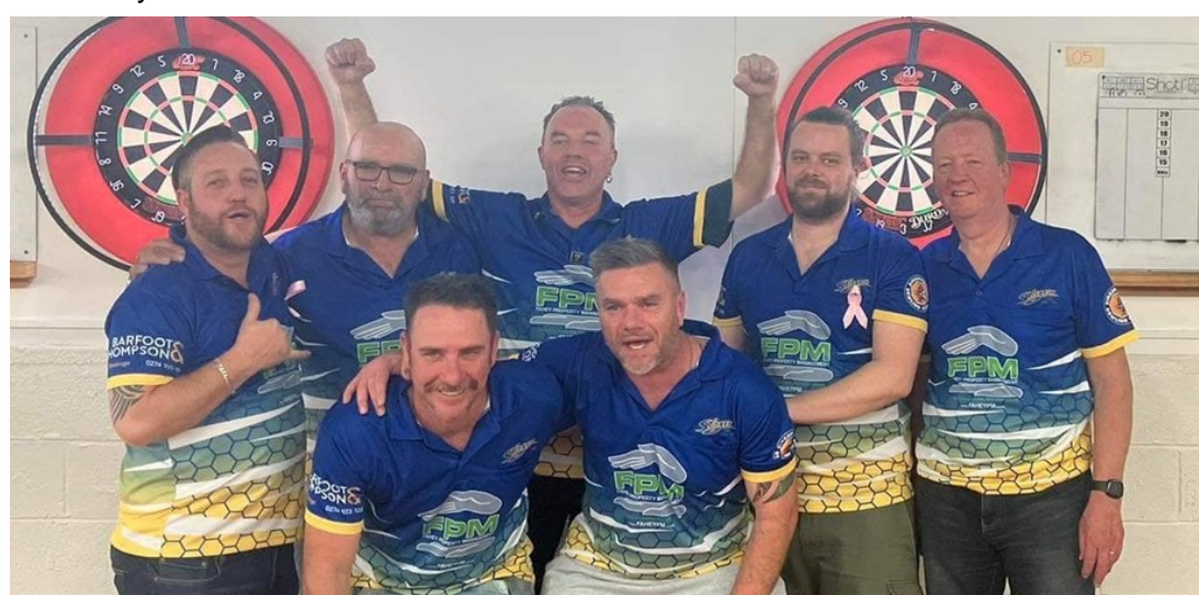
City of Sails A Grade champions for 2022 - Birkenhead Stingers, undefeated for the season